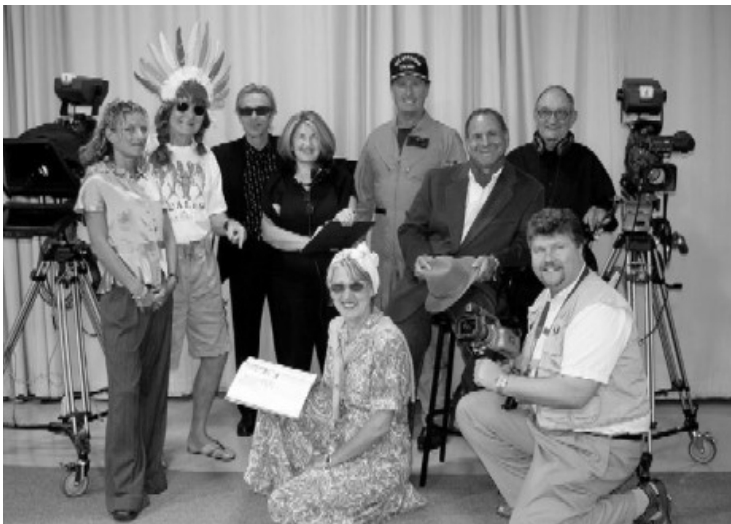
The Del Mar TV Foundation Board Members hamming it up for the cameras—hard at work?

Our goal this year is to continue improving our programming, build awareness in the community for this valuable resource, and attain a status comparable to that of a professional audio-visual broadcast communications facility. Any support you can give will be greatly appreciated, and will be exceedingly important in helping to make Del Mar Television a continuing success. We will be reaching out to touch you in the very near future, requesting your support