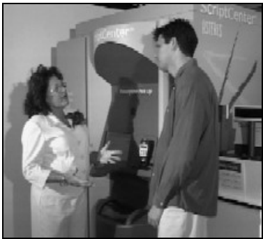
Asteres Prescription Kiosk Demonstration

We gather at the Del Mar TV Studios at 6:30pm come and pitch your idea or come help crew on someone's show!!