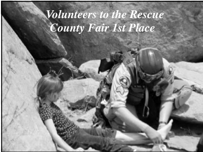
Volunteers to the Rescue County Fair 1st Place

Foundation programs placed in each of the categories of video productions at this year's San Diego County Fair.