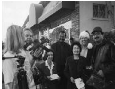
Holiday in the Village