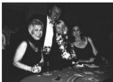
Monte Carlo Night

In the first year of the new millennium, DMTF producers covered not just the waterfront -- in our case Dog Beach! -- but all of Del Mar. Fifty-four shows dealing with subjects of community interest were produced, and most have already been cablecast via Daniels Cablevision.